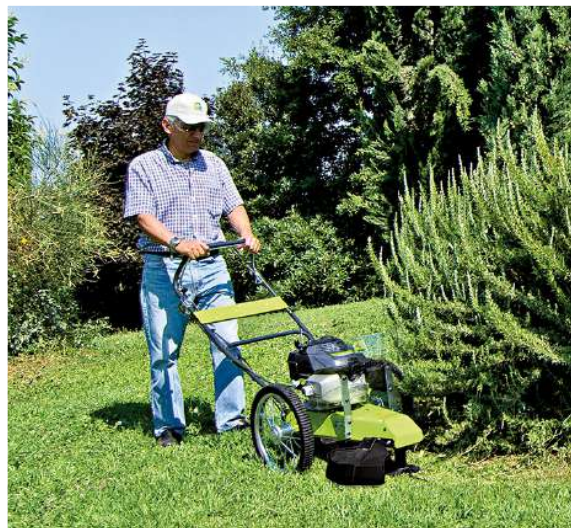
HWT 600 WD