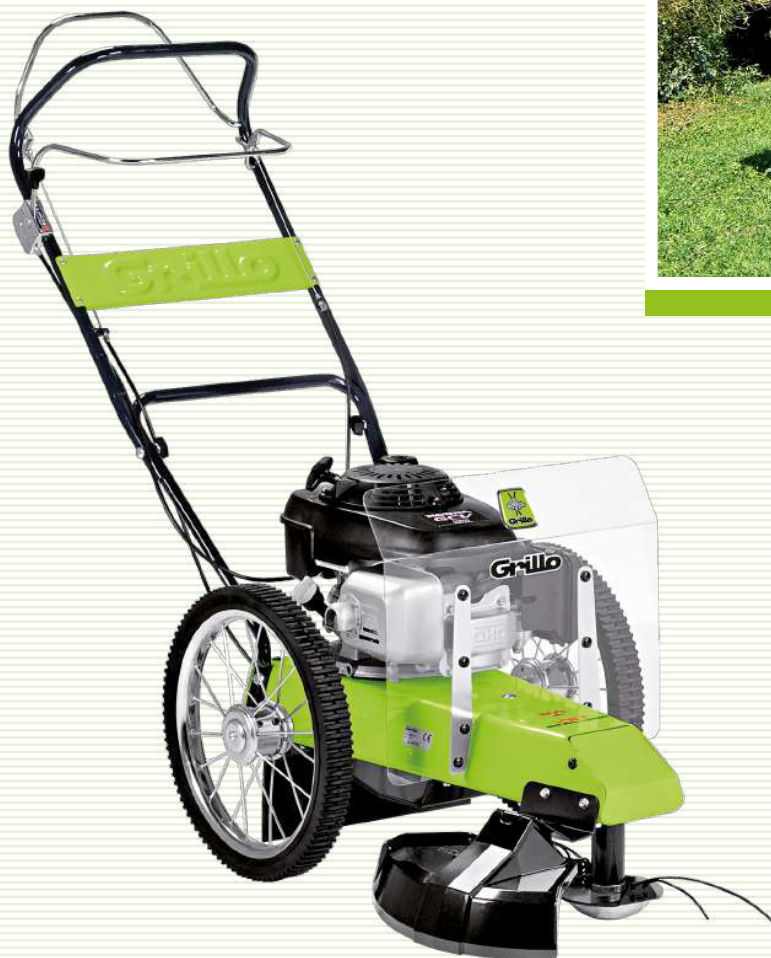
HWT 600 WD