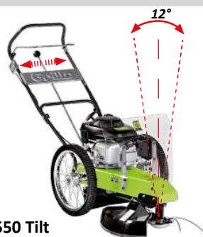
HWT 550 Tilt